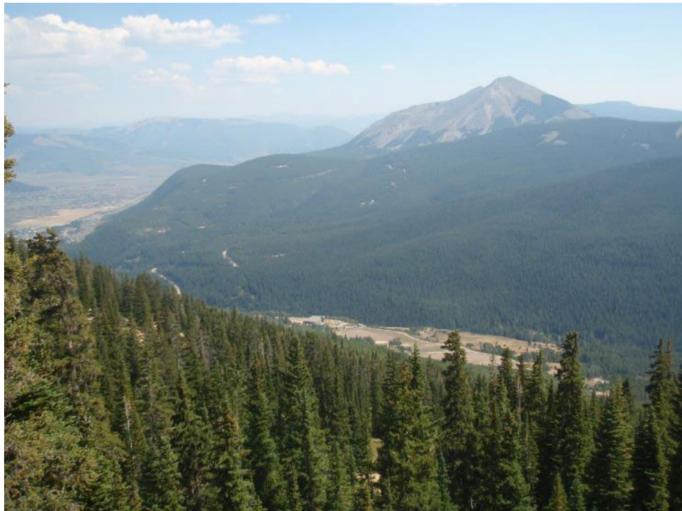
Parcel 1 (in foreground) Looking Southeast from Upper Portion (at FSR 732)