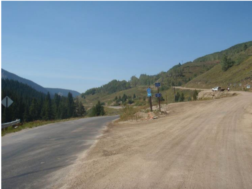
County Road 12 (left) and FSR 732 (right) Looking West towards Parcel 1