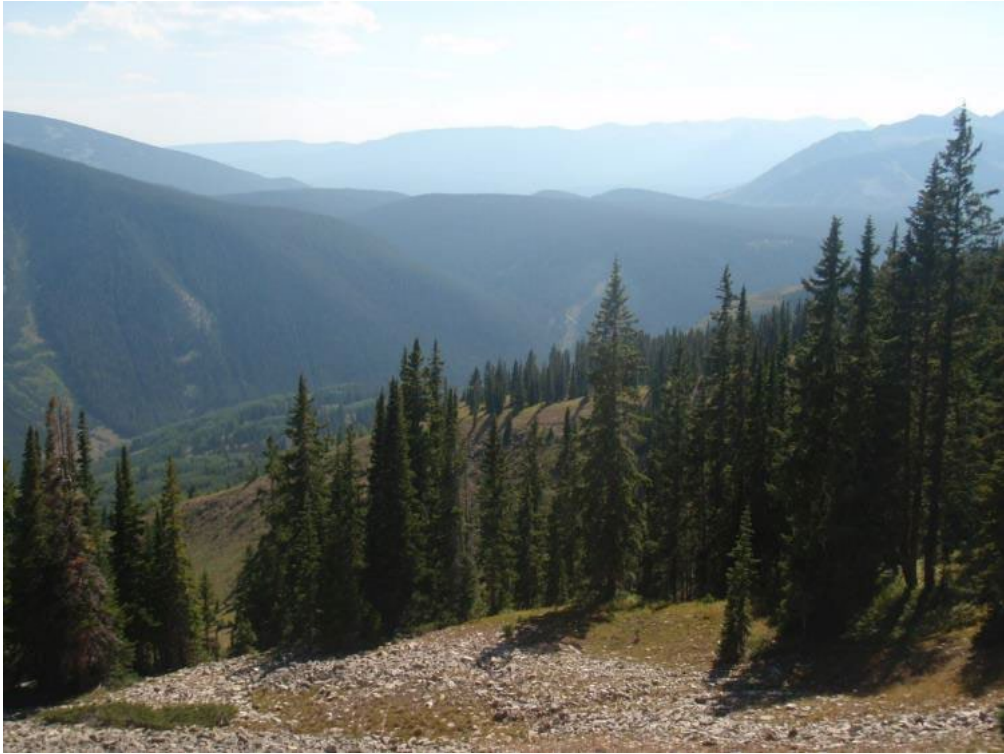
Parcel 2 (in foreground) Looking Southwest from Forest System Road 732