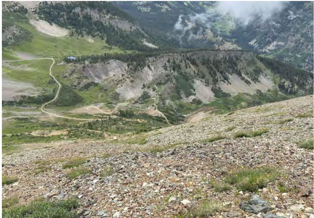
Parcel 3 (foreground) Looking Northwest towards Forest System Road 585